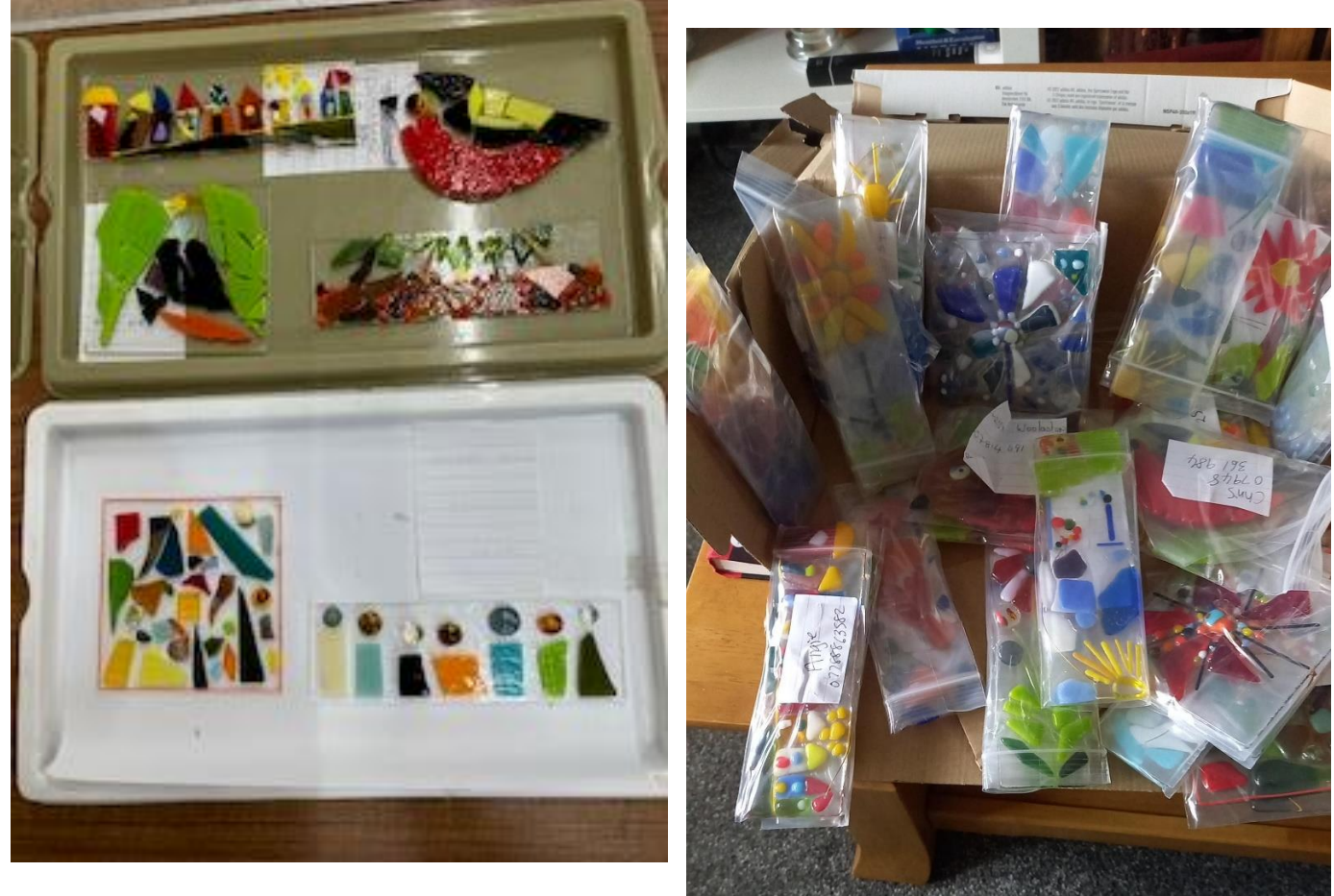
Items before firing and returned ready to go out to their creators.

A huge thankyou to Elaine Yarwood who booked this activity. We look forward to Elaine booking more interesting things for us all to do.